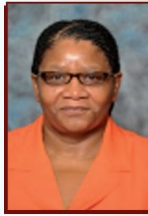
Hon Thandi Modise Premier - NW Province

Although all health facilities in the North West province provide antiretroviral (ARV) treatment to close to 190 000 HIV positive persons and was earlier in the week declared the best performing province in availability of ARV and Tuberculosis drugs by the Stop Stocks Out survey, the key to conquering HIV and Aids and achieving zero new infections, zero discrimination and zero Aids-related deaths lies in people knowing their status, Premier Modise asserted at the Provincial World Aids Day Commemoration that was held at Moshana Village near Zeerust on 1/12/2013.