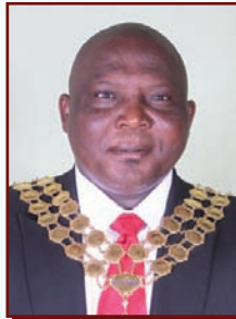
Mayor Hon. A.N. Thale

The Mayor Hon. A.N. Thale during the Mayoral Imbizo which started on the 11th November 2013 emphasized the following crucial points.