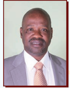
Speaker Hon. A. Thweshu

INVITATION FROM THE SPEAKER, HONOURABLE A. THWESHA